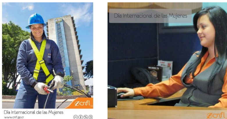
Figure #3: Women who are part of the CNFL workforce.

In the CNFL, female personnel are motivated to participate in different recruitment and promotion processes. The selection depends on the competencies and other criteria, regardless of the gender of the contestants.