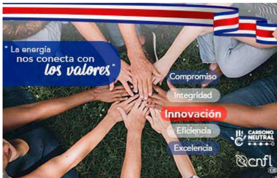
Figure #1: CNFL values.

CNFL is a public company that distributes and commercializes electrical energy in the "Great Metropolitan Area" of Costa Rica, founded by means of the Contract - Law N° 2 called "Electrical Contract" of April 8, 1941 (modified through Law N° 4197 of September 20, 1968 and Law N° 4977 of May 19, 1972). Likewise, it is governed by the provisions of the Law "Strengthening and Modernization of Public Entities in the Telecommunications Sector" No. 8660 of August 13, 2008 and the rest of the applicable legal system.