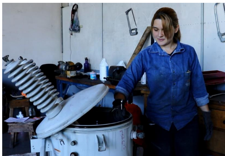
Figure #6: The talent of women working in operational areas of the company.