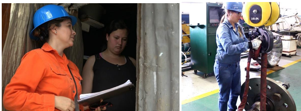
Figure #5: Cultural changes that allows women to join non-traditional roles within the company.

A barrier that will always need continuous work is the cultural issue (very closely linked to society and not to the company), since this is a process and it is normal that for different human aspects of the staff and society, there are issues or moments when there will be some resistance or regression, however, these types of situations are part of the constant challenges in gender issues.